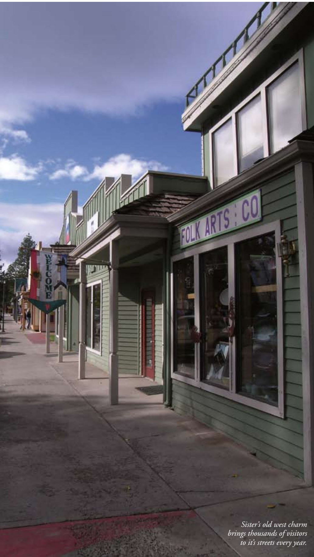
Sister's old west charm brings thousands of visitors to its streets every year.