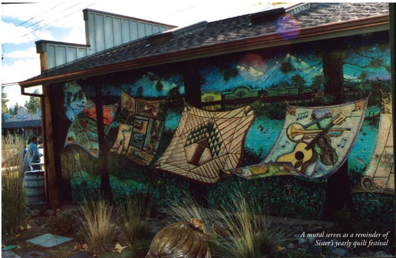
A mural serves as a reminder of Sister's yearly quilt festival

“We are really enjoying Sisters and the small town feel. This town is so small—1,490 people—and so much is going on.”